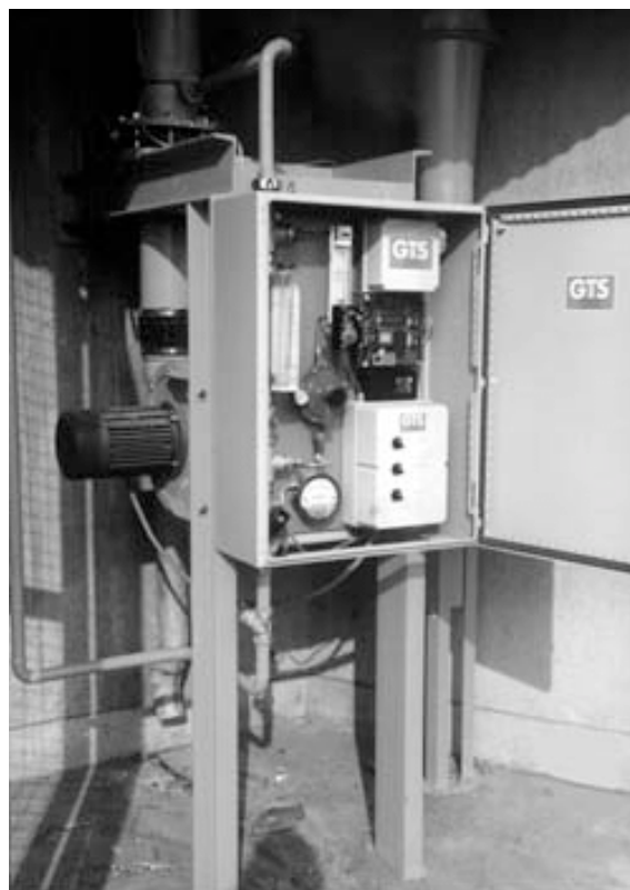
Fig. 3. One of 5 “Dispensers” for metering ECO 2 FUME gas mixture into an airstream delivered to a group of up to seven silos. The dispenser enclosure includes an air-pressure gauge, fumigant regulator, flow control valve, flow meter and electronic SIROCIRC controller. Behind the cabinet is the fan that recirculates fumigant through the silos.

required air-flows and gas-flows can be achieved, and no problems are expected when full commissioning is conducted.