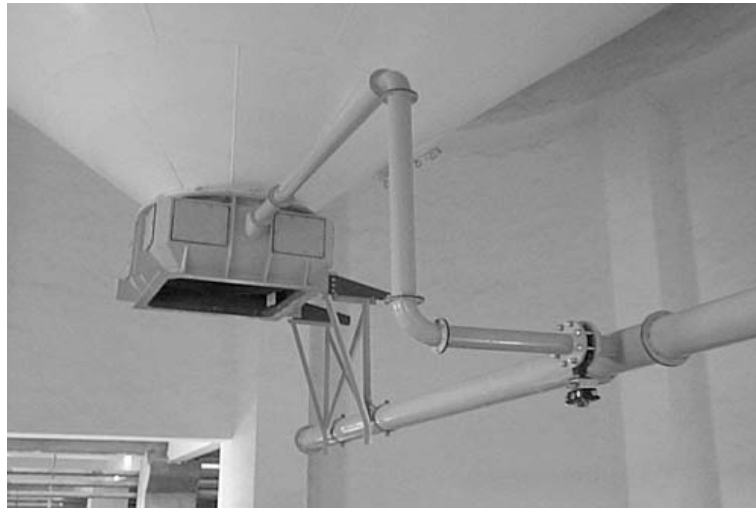
Fig. 4. Undersilo delivery ducting feeding a “diffuser” mounted to the hopper discharge (prior to installation of valves and chutework).

difficulties of delivering bulk CO 2 to the mostly remote locations involved. At the time of writing, seven of these systems have been completed and several more are in the process of installation.