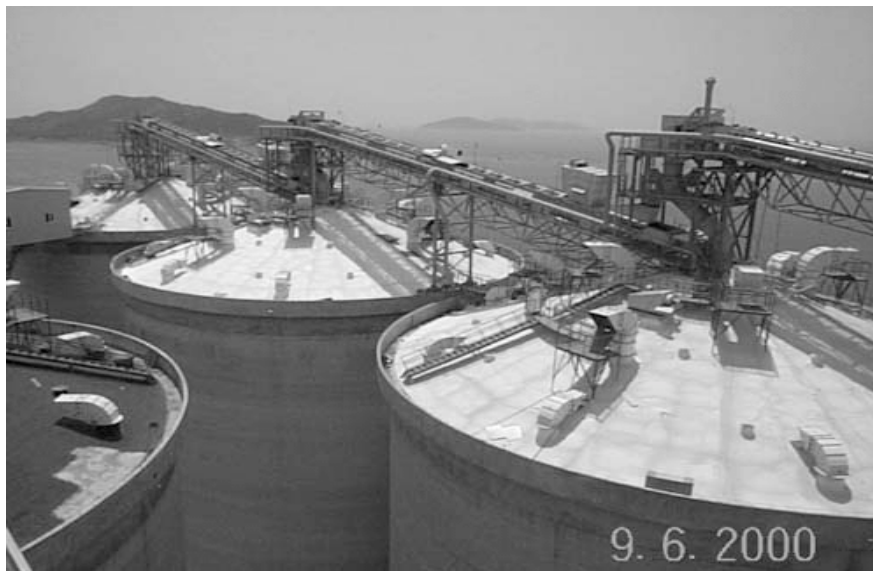
Fig. 7. Phase-2 over-silo recirculation ducting including exhaust vent over nearest bin.