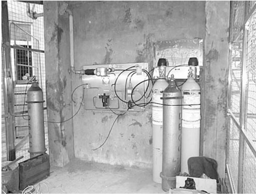
Fig. 2. VAPORPH 3 OS enclosure and ECO 2 MIXER with automatic cylinder valve operation