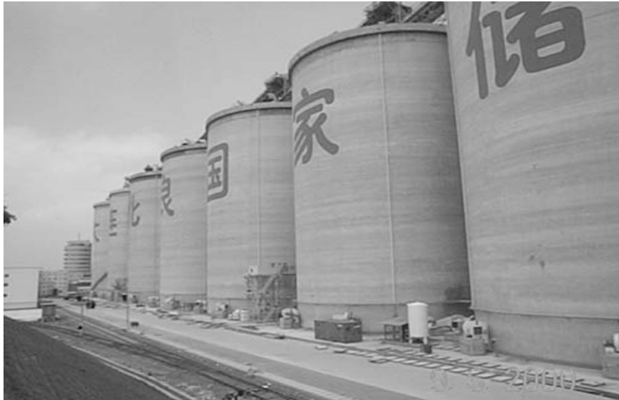
Fig. 6. Dalian Phase-2 Silos: 20 bins each 30,000 tonne capacity. The GTS's CO 2 storage - tank and ECO 2 FUME on-site mixing enclosure are dwarfed by the silos. Fumigant delivery ducting can be seen around the lower part of each silo.