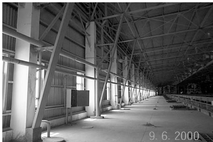
Fig. 5. Oversilo ducting including condensation traps above each silo roof connection